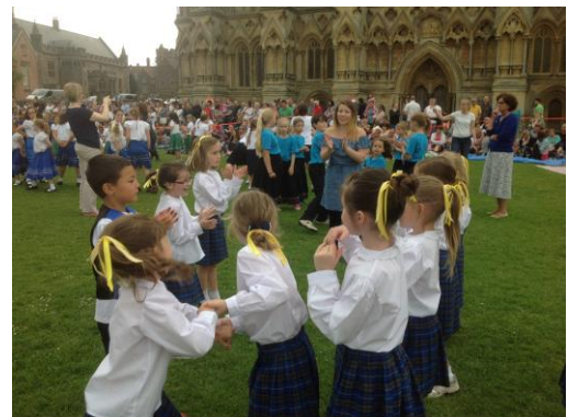
KS1 children attending the Wells Cathedral Country Dancing Festival

All children will be allocated a house to join. House points are awarded for work, conduct, social behaviour and effort. There are a variety of inter-house competitions held throughout the year covering all aspects of the sports curriculum.