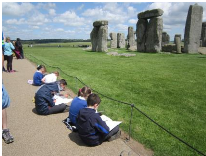
Kestrels Class visiting Stonehenge for an art project

All trips “mainly in school time” will be supported by voluntary contributions from parents. The school may cancel trips, even those of an educational nature, where sufficient contributions are not forthcoming.