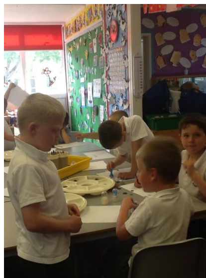
KS 1 children at work

Children should arrive at school at 8.40 a.m. when the school is opened and unless engaged in an after-school activity, the children are expected to be off the premises by ten minutes after the end of school.