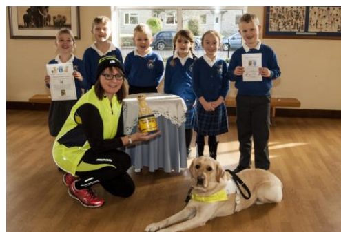
KS1 children meeting a guide dog after a whole school fundraising event.

The school is justly proud of its pupils and their achievements and our school uniform reflects this. Please select from the following list.