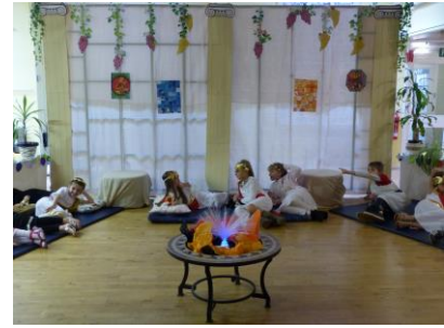
KS2 Roman Day

The children will be asked to complete some homework tasks to support the work that is being undertaken in class or to help with the current class project.