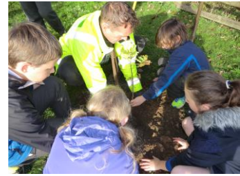
KS2 children helping plant oak trees in Somerton

The children on each site eat lunch with their friends in the school hall, with those having hot meals and packed lunches sitting together.