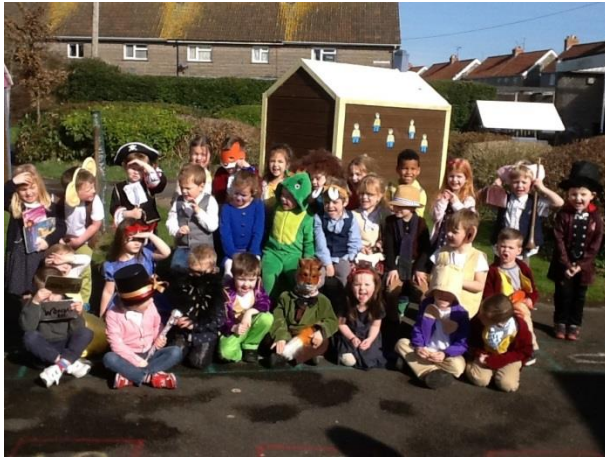
KS1 World Book Day

Children are also encouraged to learn basic maths (e.g. tables) and new words, practise their handwriting, spellings and read at home.