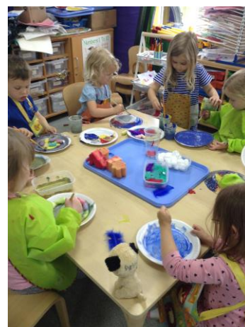
Owlets at play

The funds raised enable the academy to provide extra resources to enrich the curriculum of the school.