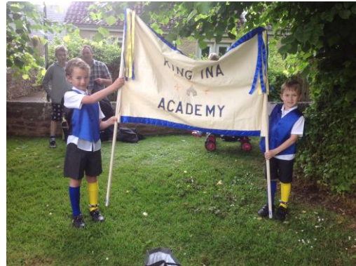
Country Dancing on Wells Cathedral Green

Welcome to our new school guide for parents for the academic year starting in September 2018. We hope this prospectus will provide you with all the essential information you might need about our academy, as well as offer a brief insight to what life is like here at King Ina.