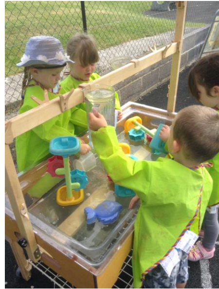
Owlets at Play

For reasons of health and safety children with pierced ears must wear 'studs' only during school time, and must remove their earrings during P.E. lessons.