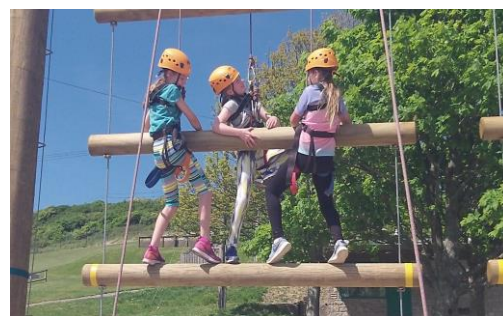
Year 6 trip to Osmington Bay