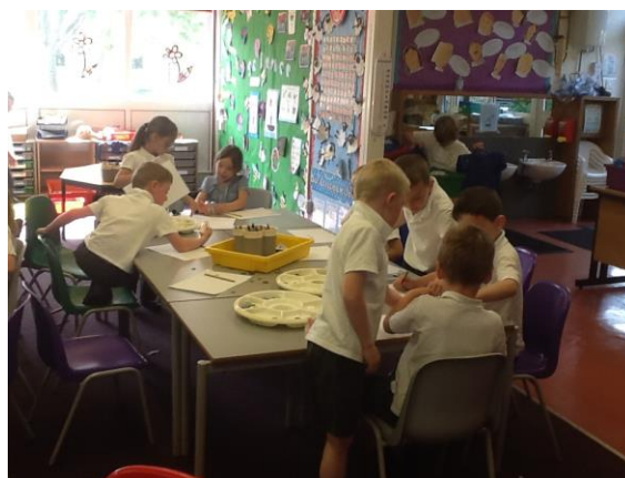
KS1 children at work

Details are available from the school office.