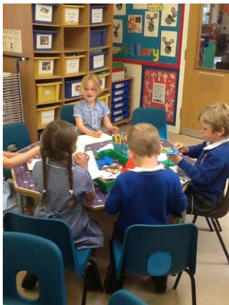
KS1 children at work

For full details please see our Attendance Policy – attached to this document.