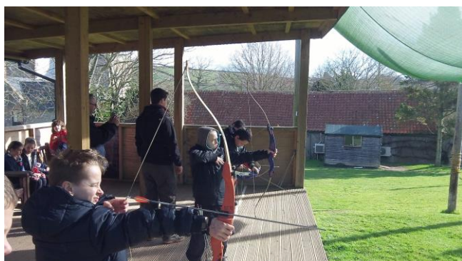
Years 3, 4 and 5 Residential trip to Kilve Court

Every year all KS2 children will be offered the chance of taking part in a residential trip. In the last year our years 3, 4 and 5 children have spent two nights away at the Kilve Court Residential Centre and the year 6 children have spent two nights in the PGL centre at Osmington Bay. Details of residential trips are circulated at the beginning of the School Year.