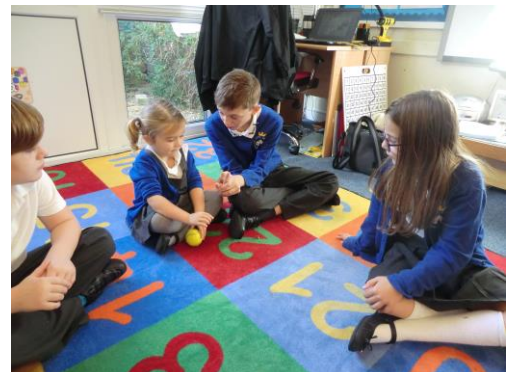
KS2 and KS1 children working together