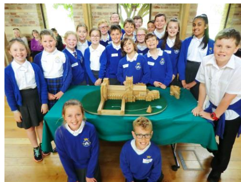
KS2 trip to Wells Cathedral studying art

Collective Worship is held daily and includes Praise Assemblies, Hymn Practice and Class worship.