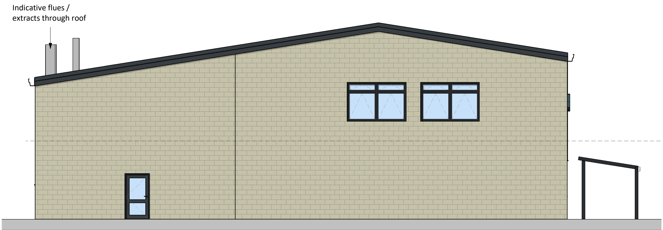
Proposed West Elevation 1 : 100