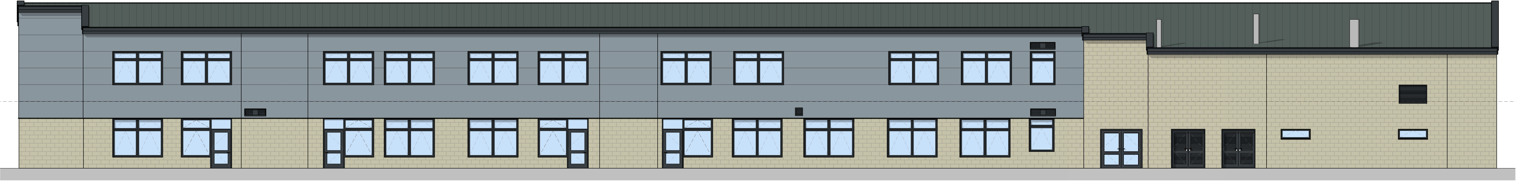
Proposed North Elevation 1 : 100