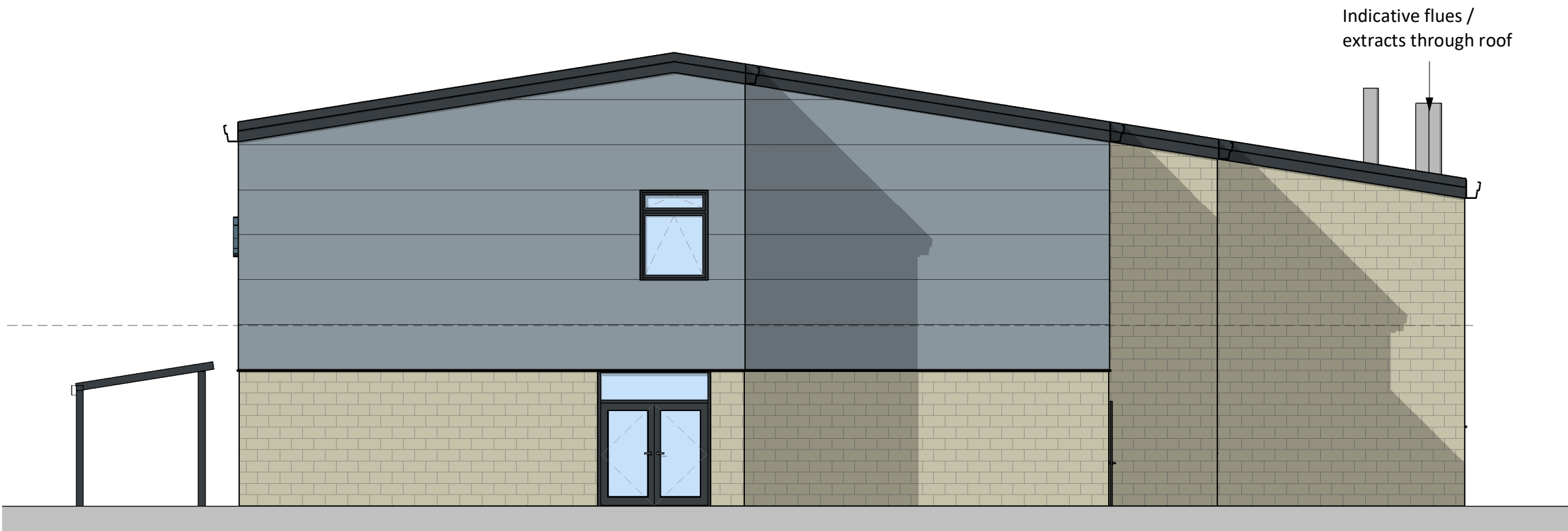
Proposed East Elevation 1 : 100