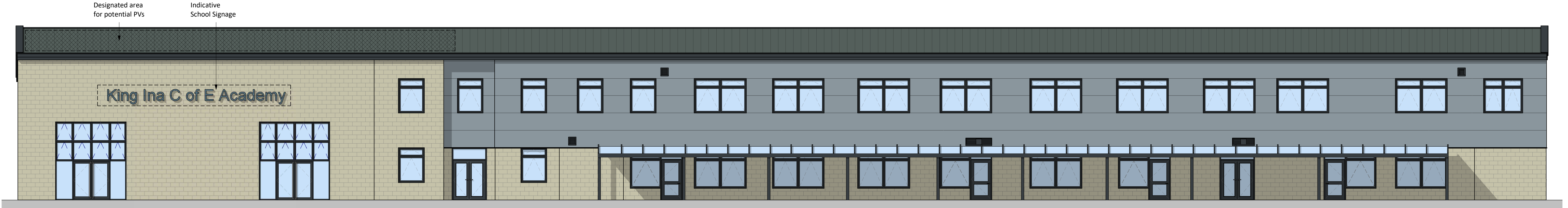
Proposed South Elevation 1 : 100